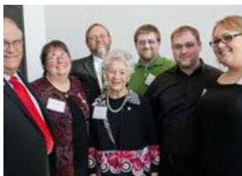
Honouree and family