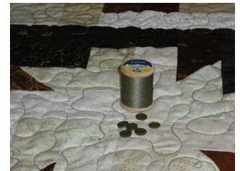
Spool of thread