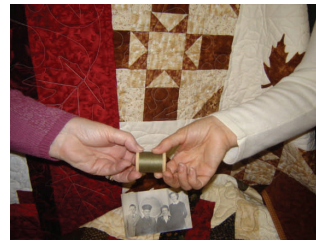
Presentation of the spool of thread